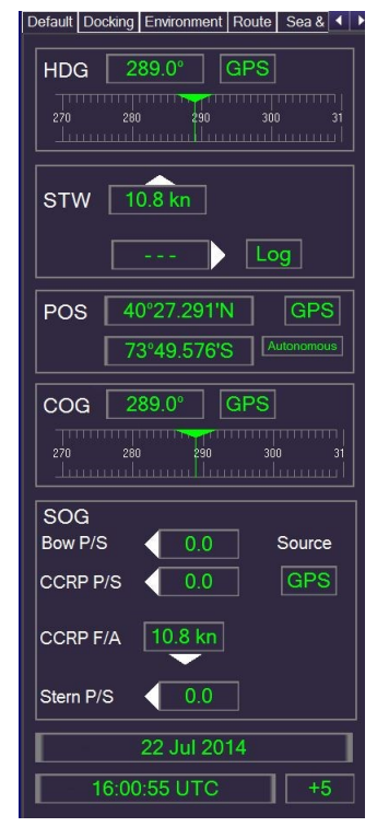
Default Conning Window