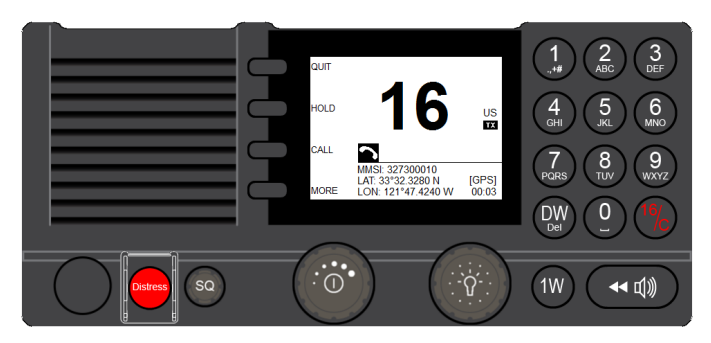
Sailor 6222 VHF DSC Radio