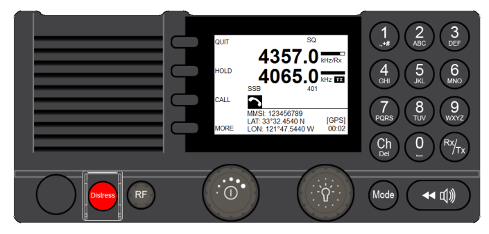
Sailor 6301 MFHF DSC Radio